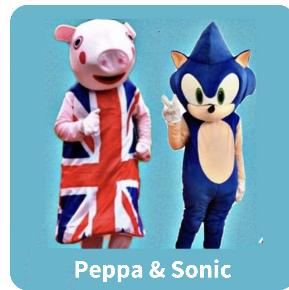
Peppa & Sonic