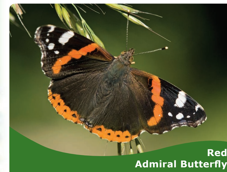
Red Admiral Butterfly